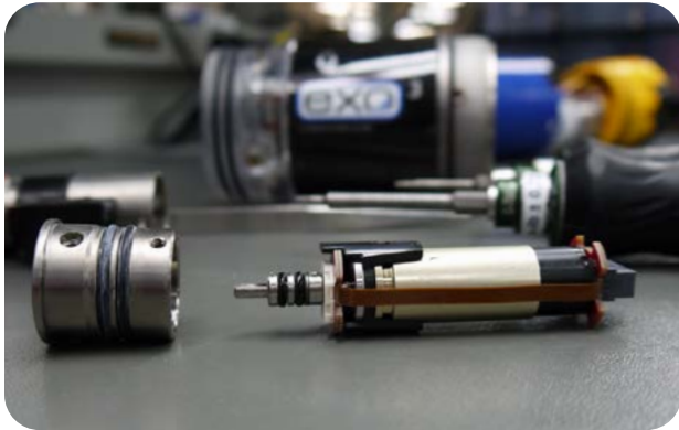
Annual Wiper service is critical to providing the best anti-fouling protection

All work is performed by expert technicians. This includes comprehensive inspection and seal restoration, as well as other services only the factory can provide.