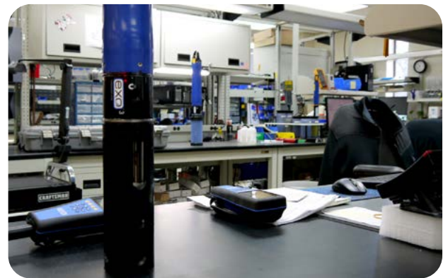
Factory Service Center located in Yellow Springs, Ohio

YSI Incorporated 1725 Brannum Lane Yellow Springs, OH 45387